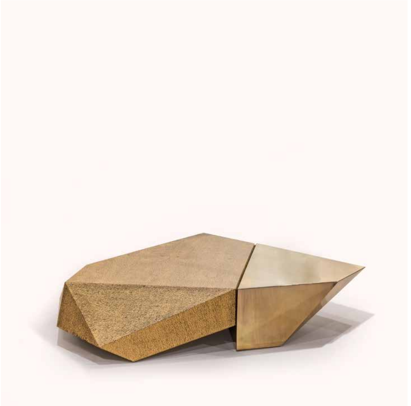
APOLLO 2018 ALPACCA, LACEWOOD H 12" W 65.8" D 60" | H 30 W 167 D 152 CM EDITION OF 10