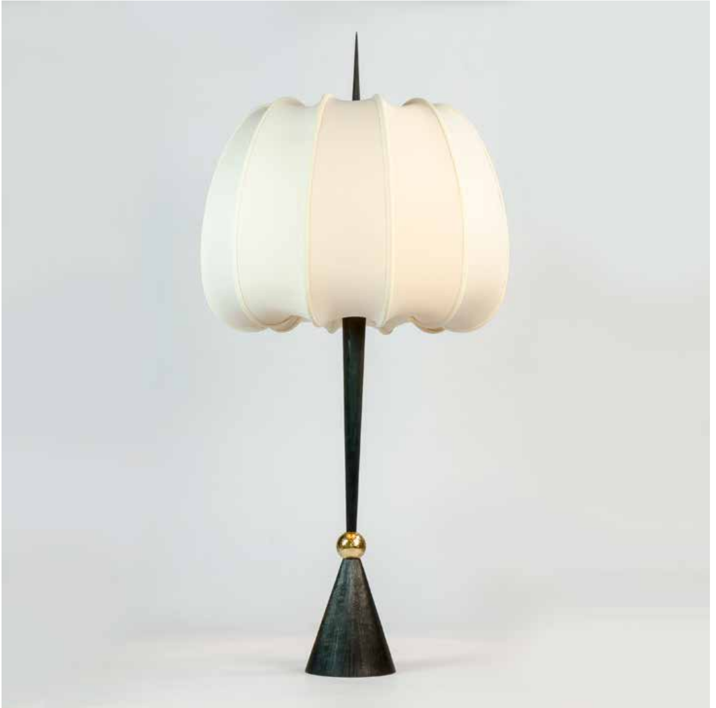
LANCEA KYOTO 2017 BRONZE, BRASS, SILK, LIGHT FITTINGS H 39" W 15" D 15" | H 100 W 40 D 40 CM EDITION OF 10