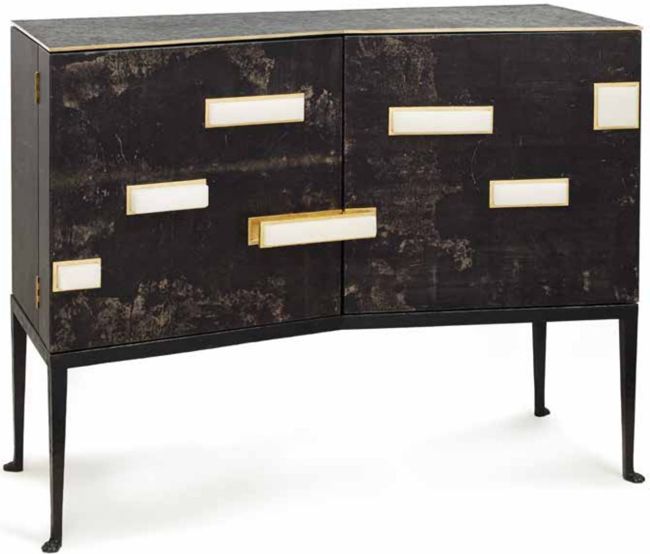
PALATINO (ONYX) 2016 PARCHMENT, ONYX, BRONZE, GILDED BRONZE, GLASS H 37" W 47.25" D 18" | H 93 W 120 D 45 CM EDITION OF 6