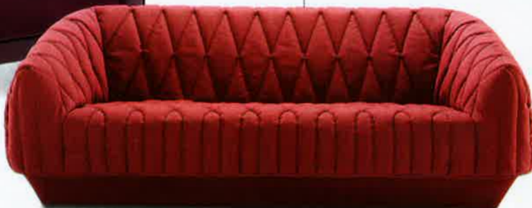
1 Garda sofa with a lacquered base and bronze details by Achille Salvagni through Maison Gerard, price upon request. 2 The single-cushion Paul sofa with aluminum legs from Molteni & C, from $8,965. 3 Ether settee in velvet from Jonathan Adler, $3,950. 4 Finale sofa seen here with a matte-black base from Bernhardt Design, from $3,500. 5 Targa sofa seen here with brass feet from Wiener GTV Design, from $3,900. 6 MyHome sofa with stainless steel feet from Fendi Casa through Luxury Living, from $17,450. 7 The all-foam Cover 2 sofa from Ligne Roset with a removable slipcover, $3,965.