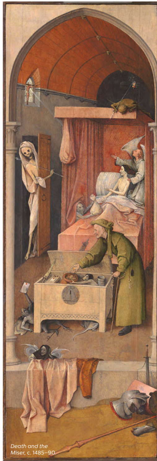
Death and the Miser, c. 1485–90.

Hieronymus Bosch was a pious, hardworking painter with a wild and weird imagination. Living in the Dutch town of 's-Hertogenbosch, he rendered angels and devils, saints and sinners in phantasmagorical arrays. To mark the 500th anniversary of his death, nearly all of his panels and drawings will return from museums around the globe to the town's Noordbrabant Museum for a landmark exhibition—part of a yearlong celebration that includes Bosch-inspired dance and theater performances (February 13–May 8; hnbm.nl).